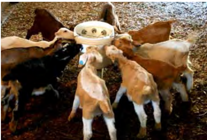
Livestock and Dairy

Focus on California and the possibility of a Federal Milk Market Order (FMMO) replacing the current CDFA pricing program waned in early 2014, as prices received recovered from the lows seen the prior two years. The 2104 Farm Bill revived the discussion with language permitting some form of the California quota system if a FMMO is adopted. As milk prices dropped in the final months of 2014 and discontent mounted over CDFA adjustments to the pricing formulas, the issue was revitalized. Throughout the year, the extended drought was a principle concern for many dairies as it impacted both water availability and feed costs. Organic dairies struggled to find forage to fulfill the National Organic Program's requirement of a minimum of 120 days on pasture. A USDA temporary variance on this requirement provided