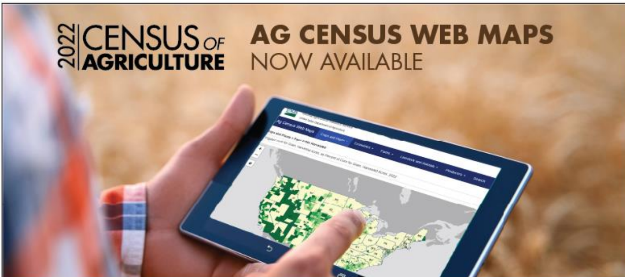
Ag Census Web Maps application