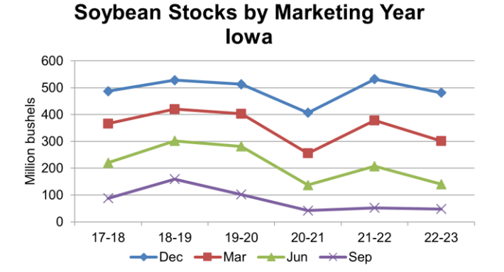
Grain Stocks by Position - Iowa and United States: September 1, 2022 and 2023