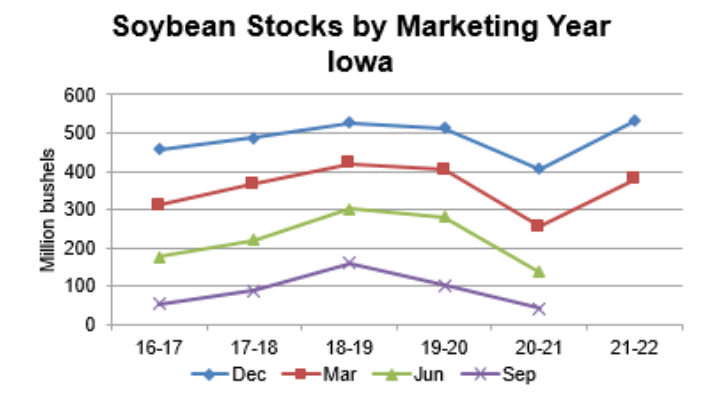
Grain Stocks by Position - Iowa and United States: March 1, 2021 and 2022