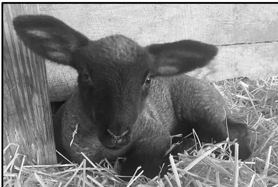
“New Life on the Farm”