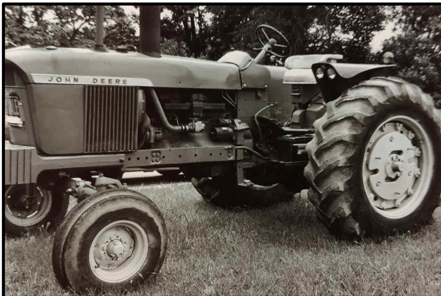
“Grandpa & I’s Ride”