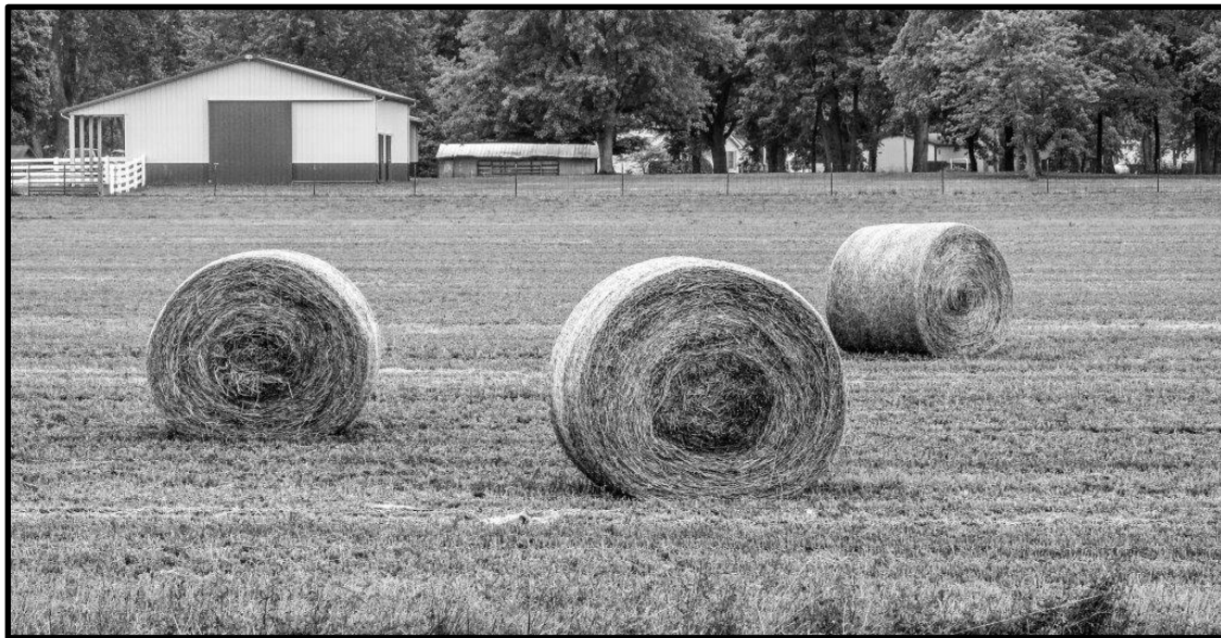
"Hay Bales in a Field" Photographer ~ Zachary Snider Age 14, Sheridan, IN