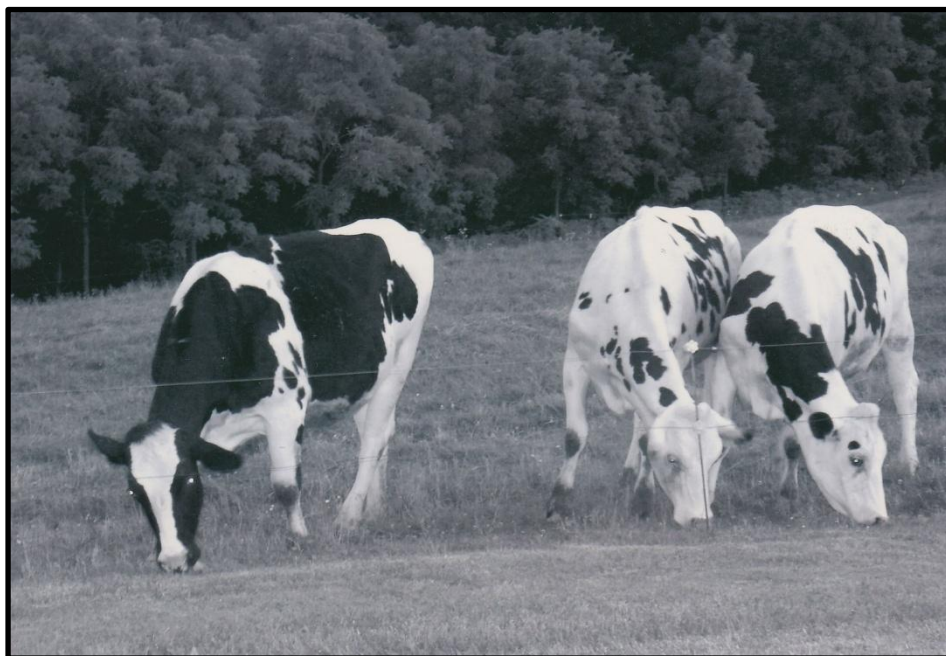
"Cows Grazing"