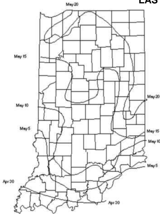
10% Probability for Frost (32°F) After the Date