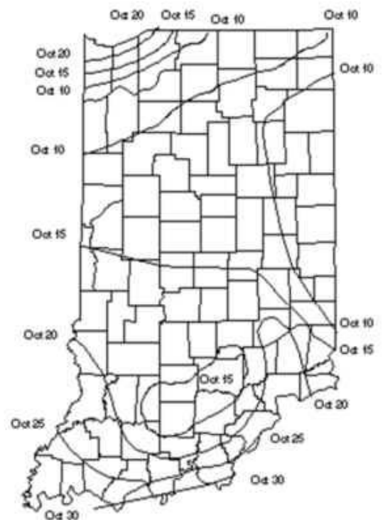
50% Probability for Frost (32°F) Before the Date