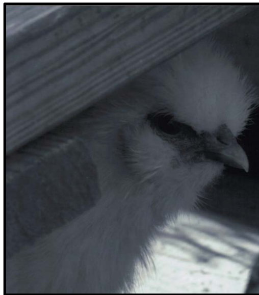
"Flossie" Photographer -- Caitlin Crumes Age 16, Lexington, IN

1/ Annual estimates cover the period December 1 previous year through November 30.