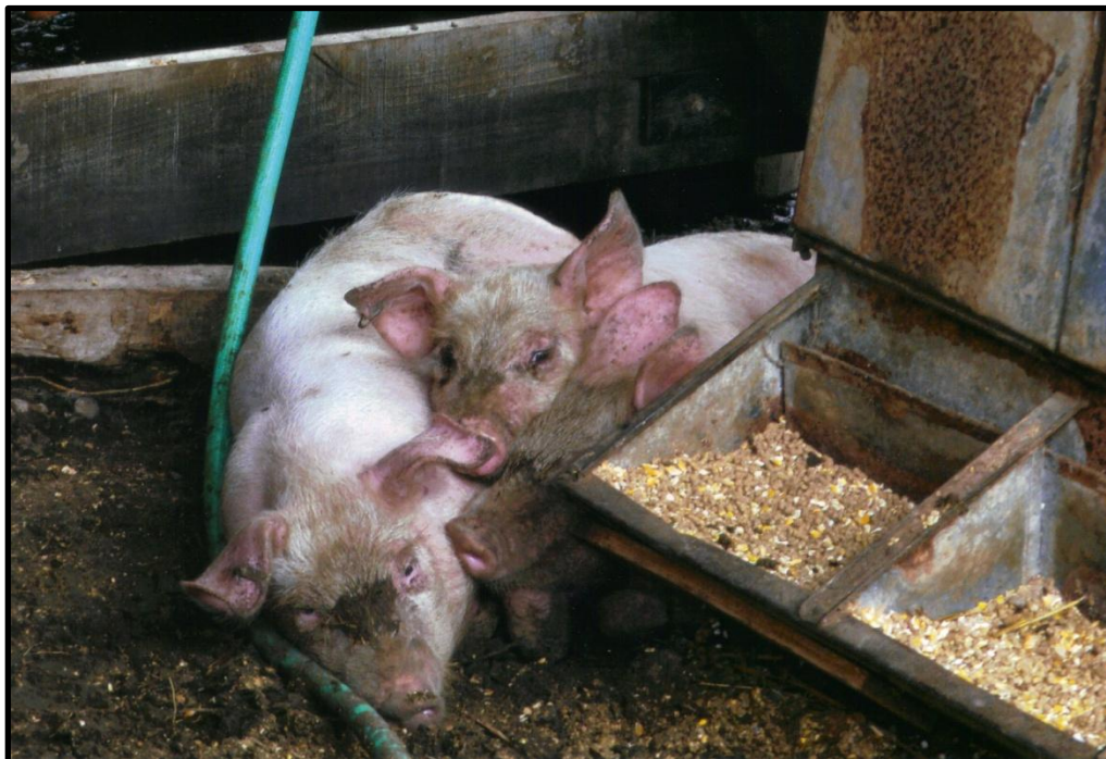
“The Three Little Pigs” Photographer ~~ Hanah Crowe Age 18, Bloomfield, IN