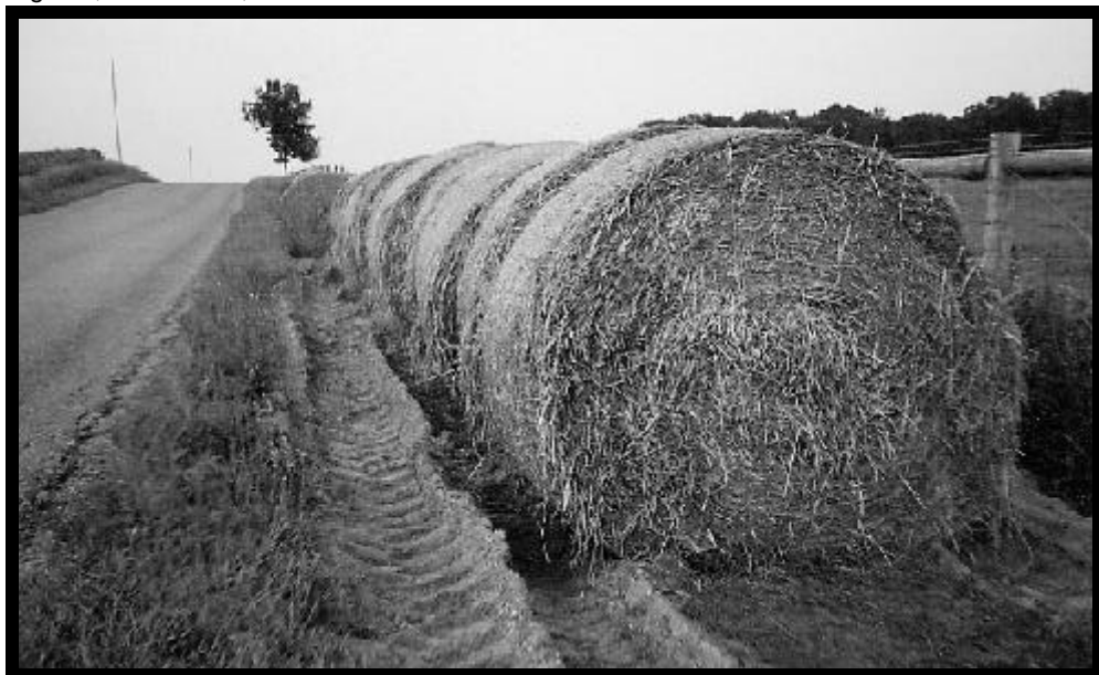
"Bales in a Row"