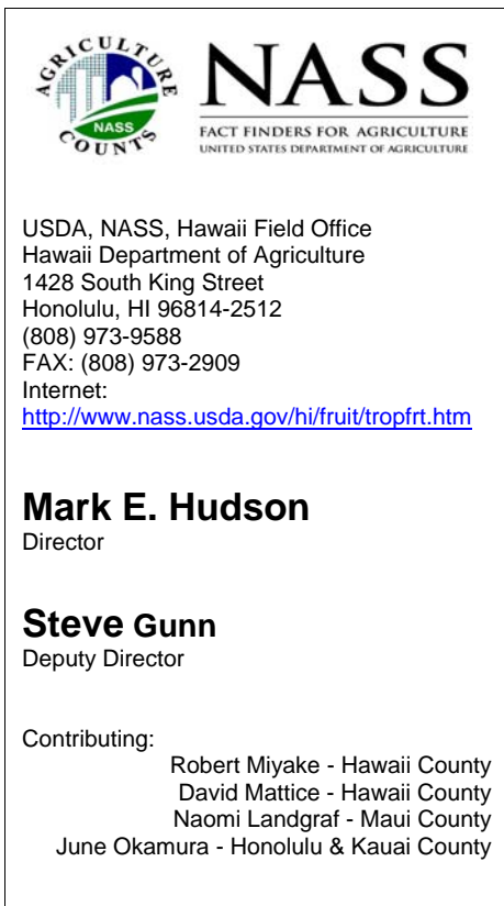
TROPICAL SPECIALTY FRUITS: In crop and harvested acreage, State of Hawaii, 1991-2004

Fruits included in this survey are listed at the bottom of this page. Not all fruits are published separately to avoid disclosure of individual operations.