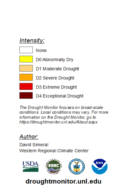
May 21, 2024 (Released Thursday, May. 23, 2024) Valid 8 a.m. EDT