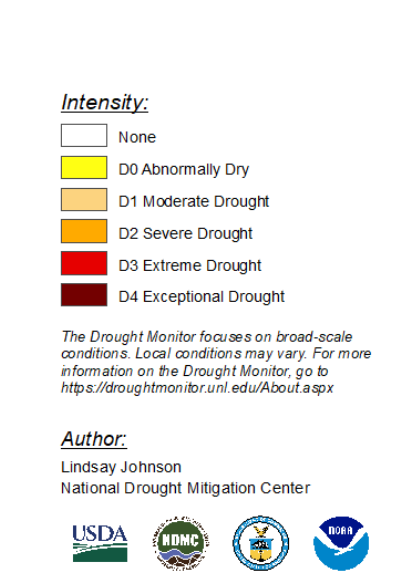
April 16, 2024 (Released Thursday, Apr. 18, 2024) Valid 8 a.m. EDT