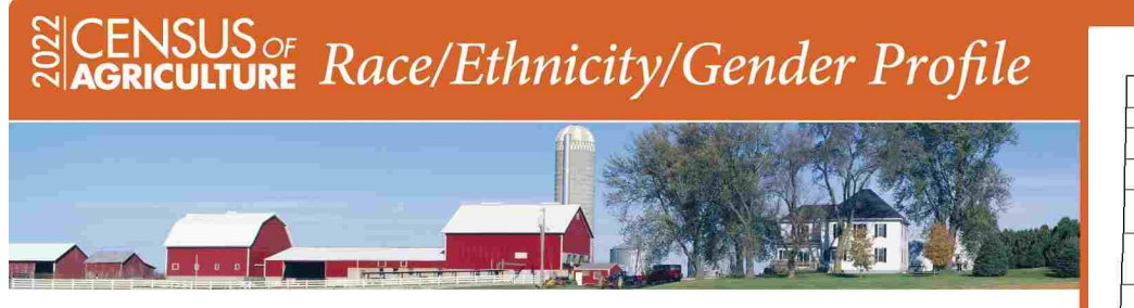
Wood County, Ohio Farms with White Producers<sup>a</sup>