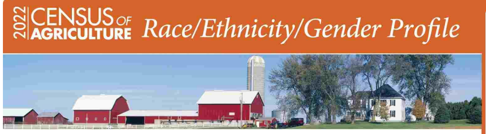
Perry County, Ohio Farms with Asian Producers<sup>a</sup>

Data not available at this geographic level for farms with Asian Producers.