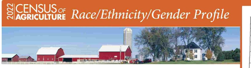
Perry County, Ohio Farms with White Producers<sup>a</sup>