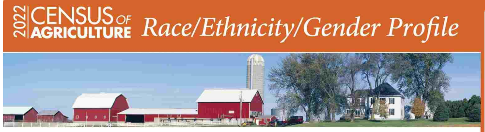
Knox County, Ohio Farms with Asian Producers<sup>a</sup>

Data not available at this geographic level for farms with Asian Producers. <sup>a</sup> This race alone or in combination with other races.