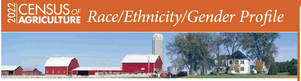
Gallia County, Ohio Farms with Asian Producers<sup>a</sup>