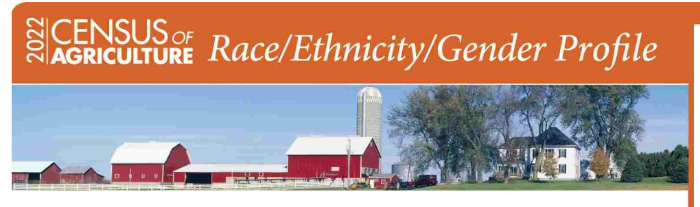
Pike County, Illinois Farms with Asian Producers<sup>a</sup>

Data not available at this geographic level for farms with Asian Producers. <sup>a</sup> This race alone or in combination with other races.