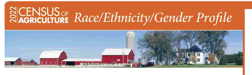
Pike County, Illinois Farms with White Producers<sup>a</sup>

Data not available at this geographic level for farms with White Producers. <sup>a</sup> This race alone or in combination with other races.