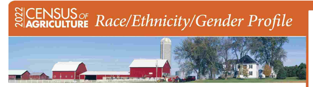
Pike County, Alabama Farms with Asian Producers<sup>a</sup>

Data not available at this geographic level for farms with Asian Producers. <sup>a</sup> This race alone or in combination with other races.