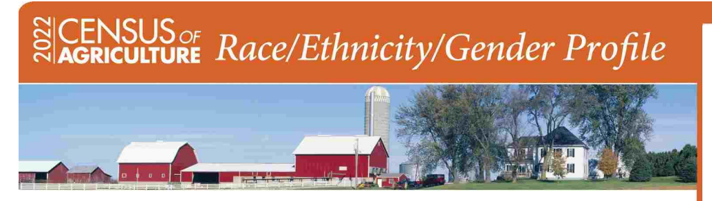
Dale County, Alabama Farms with Asian Producers<sup>a</sup>

Data not available at this geographic level for farms with Asian Producers. <sup>a</sup> This race alone or in combination with other races.